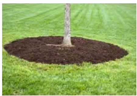
A properly mulched tree.