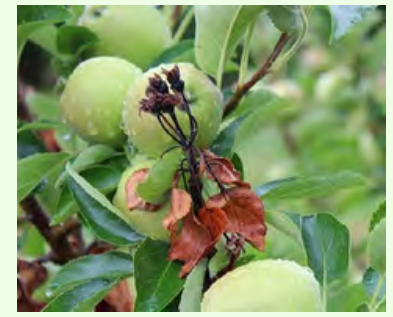
Fire blight infected apple blooms.

Diseased limbs may be flagged or painted during the growing season so they can be easily identified during winter. During late winter or early spring prune carefully so that ALL infected branches are removed. Blighted twigs should be pruned at least 6 to 8 inches below cankers and infected areas, preferably down to the branch union. Remove and destroy pruned material to eliminate potential sources of inoculum for subsequent growing seasons.