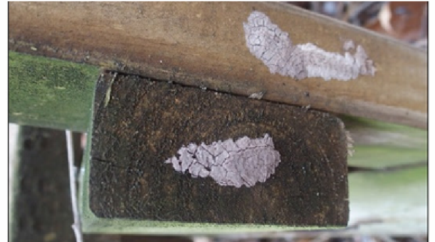
Egg masses are pictured above.

The lanternfly lays its eggs in the fall and attaches the egg masses to hard surfaces, including vehicles, firewood and outdoor furniture. You could even transport the eggs when you visit another state where they are prevalent because they can hitch a ride on cars, trucks, trains, and lumber. The egg sacs look like mud or putty and hatch in the spring, so now is the time to destroy them.