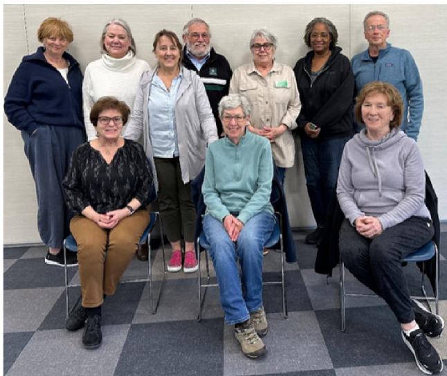
The Fayette County Master Gardener Association 2024 Board of Directors